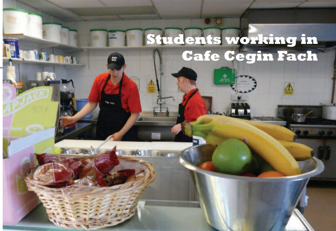
Students working in Cafe Cegin Fach

We implement practical solutions that deliver Government Policy.